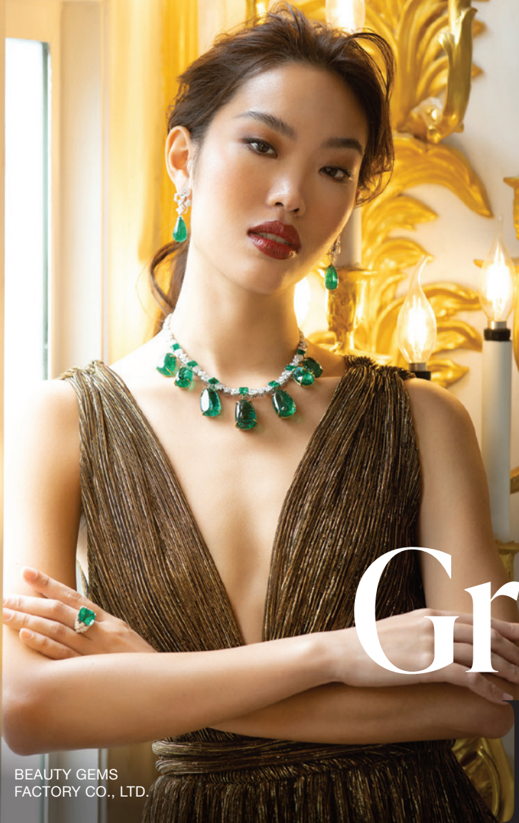
BEAUTY GEMS FACTORY CO., LTD.