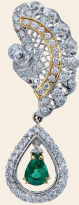
K.M.N.DIAMOND CO., LTD.