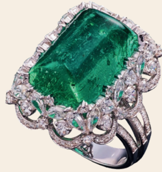
BLUERIVER 1977 CO., LTD.