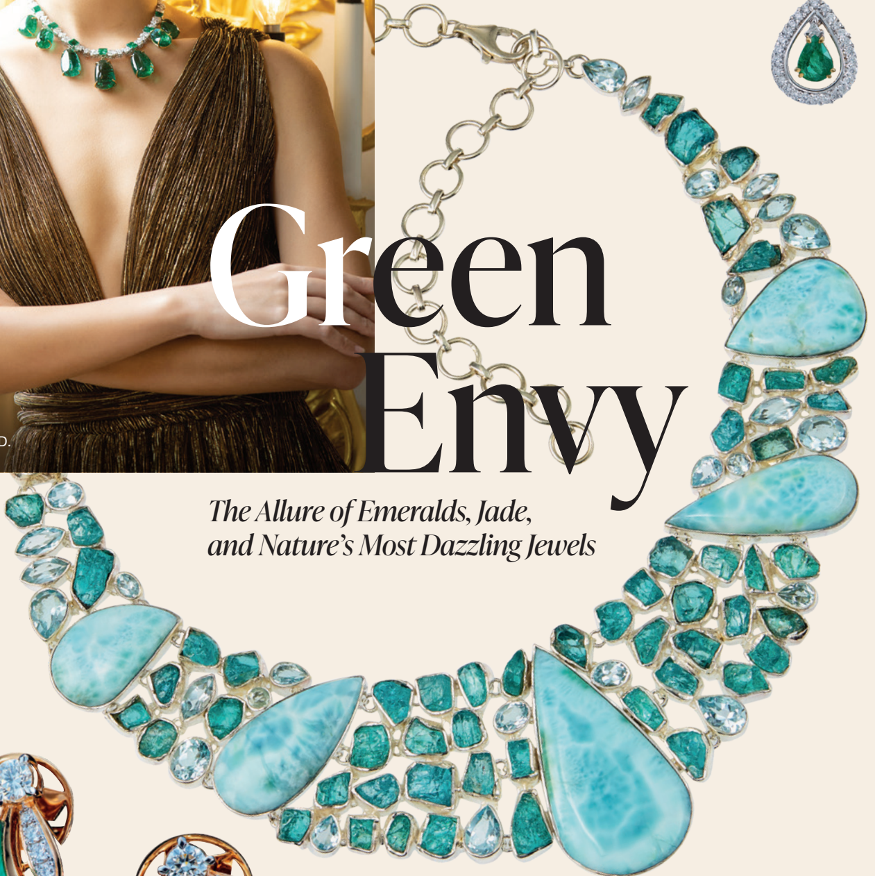
SUWAN YUGA ITALY GOLD CO., LTD.

The Allure of Emeralds, Jade, and Nature's Most Dazzling Jewels