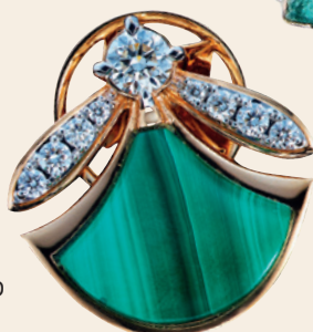
DER MOND ANANDARA CO., LTD

From timeless emeralds to the calming beauty of jade, discover how green jewelry pieces bring elegance, vitality, and a touch of nature's magic to your collection.